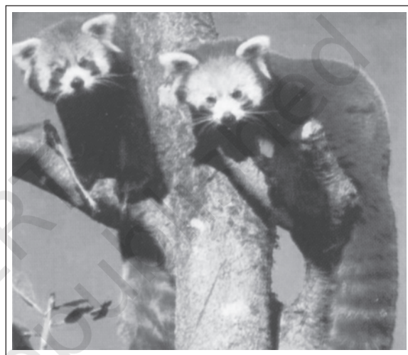
Figure 16.2 : Red Panda — an endangered species

It includes those species which are in danger of extinction. The IUCN publishes information about endangered species world-wide as the Red List of threatened species.