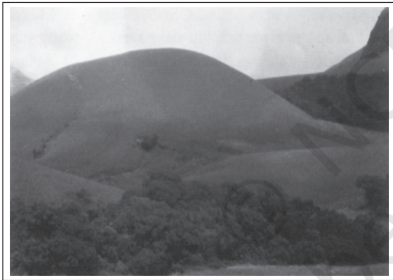
Figure 16.1 : Grasslands and sholas in Indira Gandhi National Park, Annamalai, Western Ghats — an example of ecosystem diversity

You have studied about the ecosystem in the earlier chapter. The broad differences between ecosystem types and the diversity of habitats and ecological processes occurring within each ecosystem type constitute the ecosystem diversity. The 'boundaries' of communities (associations of species) and ecosystems are not very rigidly defined. Thus, the demarcation of ecosystem boundaries is difficult and complex.