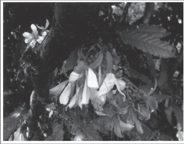
Figure 16.4 : Humboldtia decurrens Bedd — highly rare endemic tree of Southern Western Ghats (India)

There is an urgent need to educate people to adopt environment-friendly practices and reorient their activities in such a way that our development is harmonious with other life forms and is sustainable. There is an increasing consciousness of the fact that such conservation with sustainable use is possible only with the involvement and cooperation of local communities and individuals. For this, the development of institutional structures at local levels is necessary. The critical problem is not merely the conservation of species nor the habitat but the continuation of process of conservation.