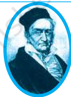
Carl Friedrich Gauss (1777 – 1855)

Carl Friedrich Gauss is often referred to as the 'Prince of Mathematicians' and is considered one of the three greatest mathematicians of all time, along with Archimedes and Newton. He has made fundamental contributions to both mathematics and science.