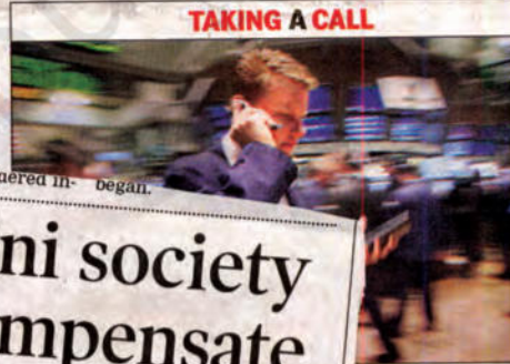
TAKING A CALL

Now those tele-service providers on the unnerving SMS will land in jail to check the menace.