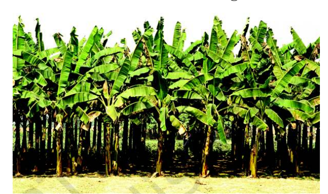
Fig. 4.2: Banana plantation in Southern part of India

In India, tea, coffee, rubber, sugarcane, banana, etc.. are important plantation crops. Tea in Assam and North Bengal coffee in