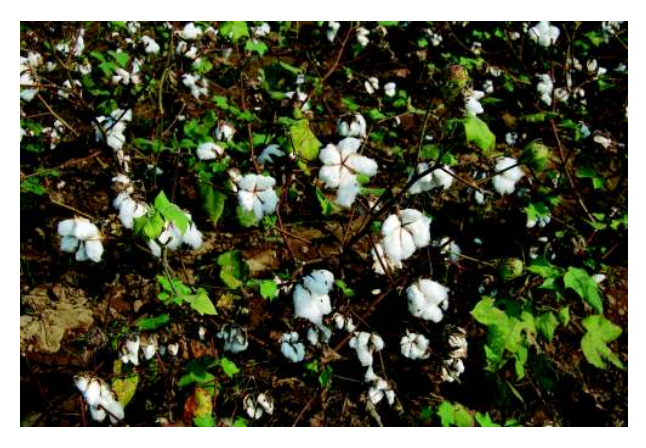
Fig. 4.15: Cotton Cultivation

Cotton: India is believed to be the original home of the cotton plant. Cotton is one of the main raw materials for cotton textile industry. In 2008 India was second largest producer of cotton after China. Cotton grows well in drier parts of the black cotton soil of the Deccan