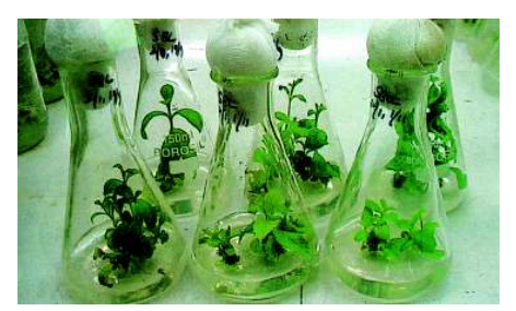
Fig. 4.17: Tissue culture of teak clones

Under globalisation, particularly after 1990, the farmers in India have been exposed to new challenges. Despite being an important producer of rice, cotton, rubber, tea, coffee, jute and spices our agricultural products are not able to compete with the developed countries because of the highly subsidised agriculture in those countries.