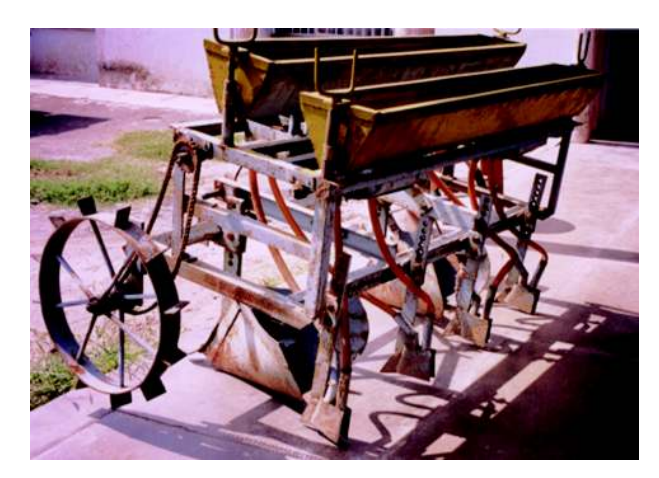
Fig. 4.16: Modern technological equipments used in agriculture

institutional reforms. Thus, collectivisation, consolidation of holdings, cooperation and abolition of zamindari, etc. were given priority to bring about institutional reforms in the country after Independence. 'Land reform' was the main focus of our First Five Year Plan. The right of inheritance had already lead to fragmentation of land holdings necessitating consolidation of holdings.