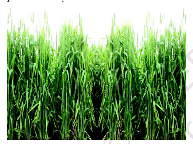
Fig. 4.5: Wheat Cultivation

wheat: This is the second most important cereal crop. It is the main food crop, in north and north-western part of the country. This rabi crop requires a cool growing season and a bright sunshine at the time of ripening. It requires 50 to 75 cm of annual rainfall evenly-distributed over the growing season. There are two important wheat-growing zones in the country – the Ganga-Satluj plains in the north-west and black soil region of the Deccan. The major wheat-producing states are Punjab, Haryana, Uttar Pradesh, Bihar, Rajasthan and parts of Madhya Pradesh.