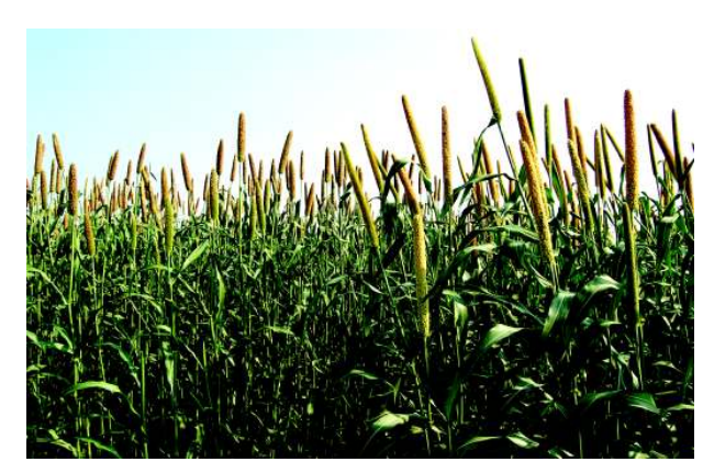
Fig. 4.6: Bajra Cultivation

Bajra grows well on sandy soils and shallow black soil. Major Bajra producing States were: Rajasthan, Uttar Pradesh, Maharashtra, Gujarat and Haryana in 2011-12. Ragi is a