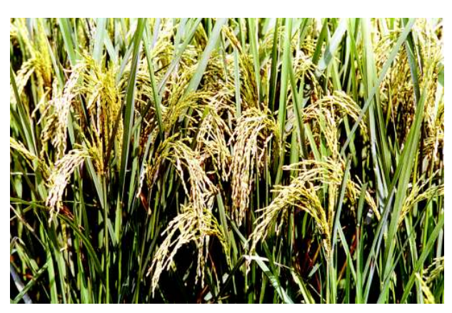
Fig. 4.4 (b): Rice is ready to be harvested in the field