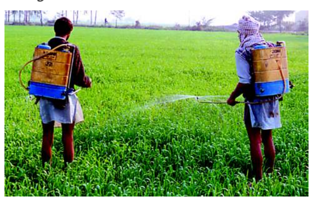
Fig. 4.18: Problems associated with heavy pesticide use are widely recognised in developed and developing countries

Can you name any gene modified seed used vastly in India?