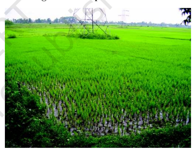
Fig. 4.4 (a): Rice Cultivation

Rice is grown in the plains of north and north-eastern India, coastal areas and the deltaic regions. Development of dense network