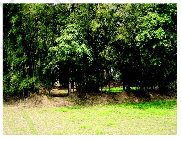
Fig. 4.3: Bamboo plantation in North-east

Karnataka are some of the important plantation crops grown in these states. Since the production is mainly for market, a well-developed network of transport and communication connecting the plantation areas, processing industries and markets plays an important role in the development of plantations.