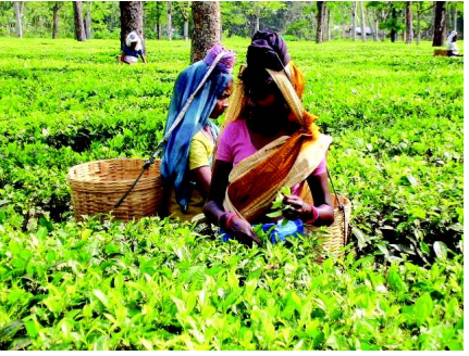
Fig. 4.10: Tea Cultivation