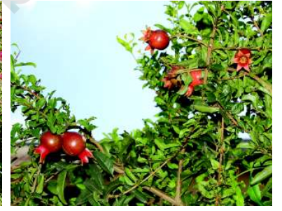
Fig. 4.12: Apricots, apple and pomegranate

Horticulture Crops: In 2008 India was the second largest producer of fruits and vegetables in the world after China. India is a producer of