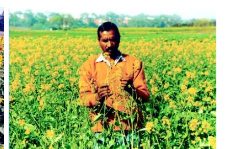
Fig. 4.9: Groundnut, sunflower and mustard are ready to be harvested in the field