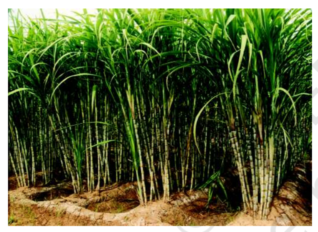
Fig. 4.8: Sugarcane Cultivation

Sugarcane: It is a tropical as well as a subtropical crop. It grows well in hot and humid climate with a temperature of 21°C to 27°C and an annual rainfall between 75cm. and 100cm. Irrigation is required in the regions of low rainfall. It can be grown on a variety of