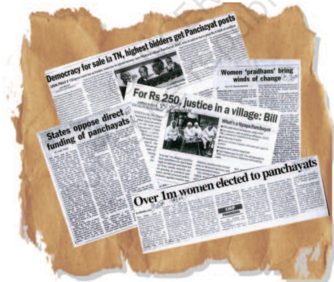
What do these newspaper clippings have to say about efforts of decentralisation in India?

Prime Minister runs the country. Chief Minister runs the state. Logically, then, the chairperson of Zilla Parishad should run the district. Why does the D.M. or Collector administer the district?