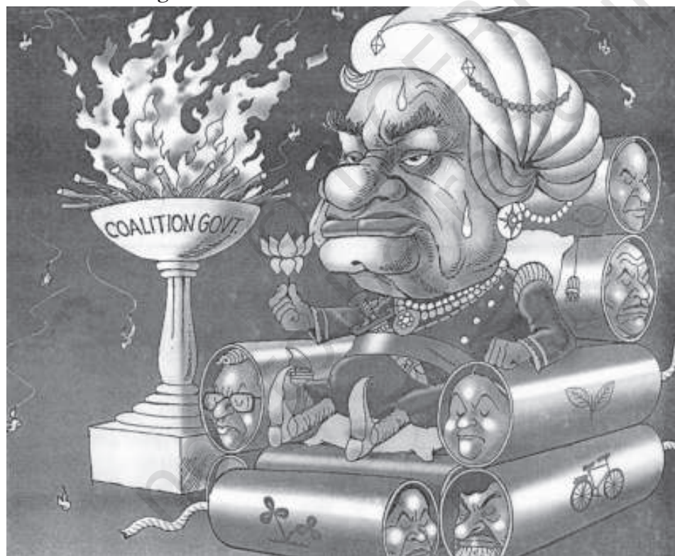
© Ajith Ninan - India Today Book of Cartoons

Here are two cartoons showing the relationship between Centre and States. Should the State go to the Centre with a begging bowl? How can the leader of a coalition keep the partners of government satisfied?