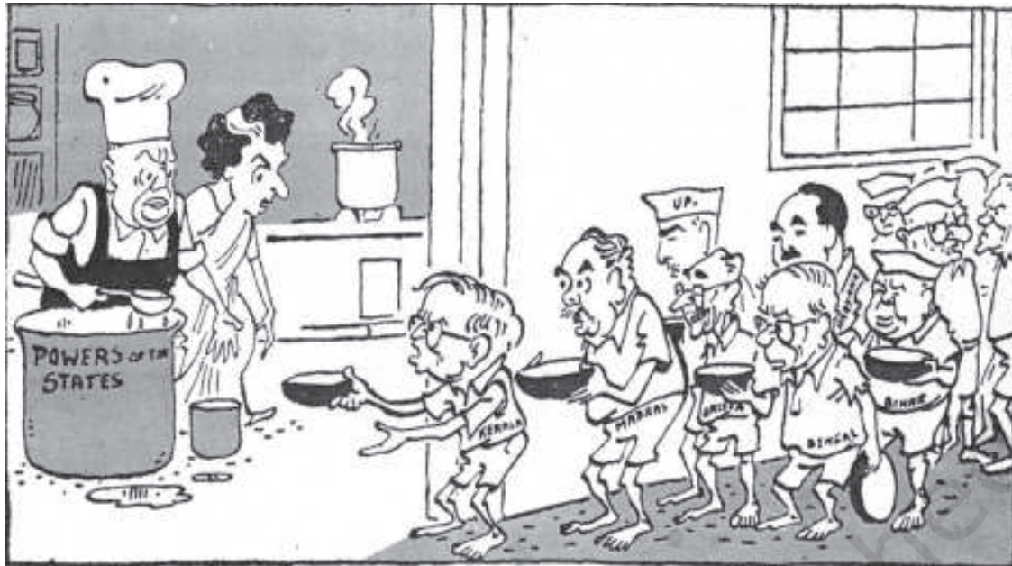
© Kutty - Laughing with Kutty