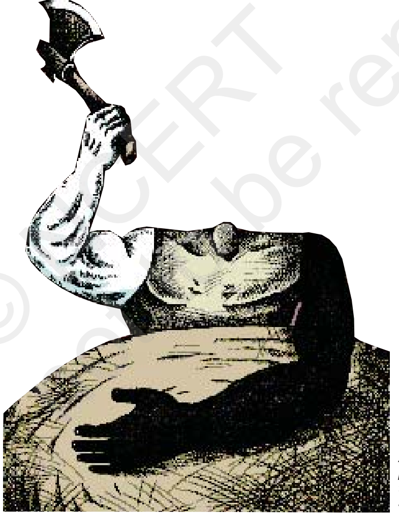
A cartoon like this can be read by different people to mean different things. What does this cartoon mean to you? How do other students in your class read this?

It is fairly common for people belonging to the same religion to feel that they do not belong to the same community, because their caste or sect is very different. It is also possible for people from different religions to have the same caste and feel dose to each other. Rich and poor persons from the same family often do not keep close relations with each other for they feel they are very different. Thus, we all have more than one identity and can belong to more than one social group. We have different identities in different contexts.