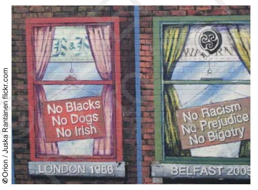
In some societies of Northern Ireland, the colonies of Protestant and Catholic communities are divided by walls. These walls are sometimes filled with graffiti as you can see here. The Irish Republican Army and British Government signed an agreement in 2005. What does the graffiti here tell about the conflict in the society?

Second, it depends on how political leaders raise the demands of any community. It is easier to accommodate demands that are within the constitutional framework and are not at the cost of another community.