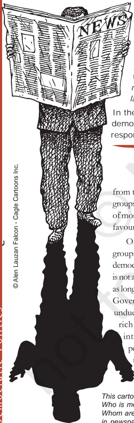
© Alen Lauzan Falcon - Cagle Cartoons Inc.

In the above passage what relationship do you see between democracy and social movements? How should this movement respond to the government?